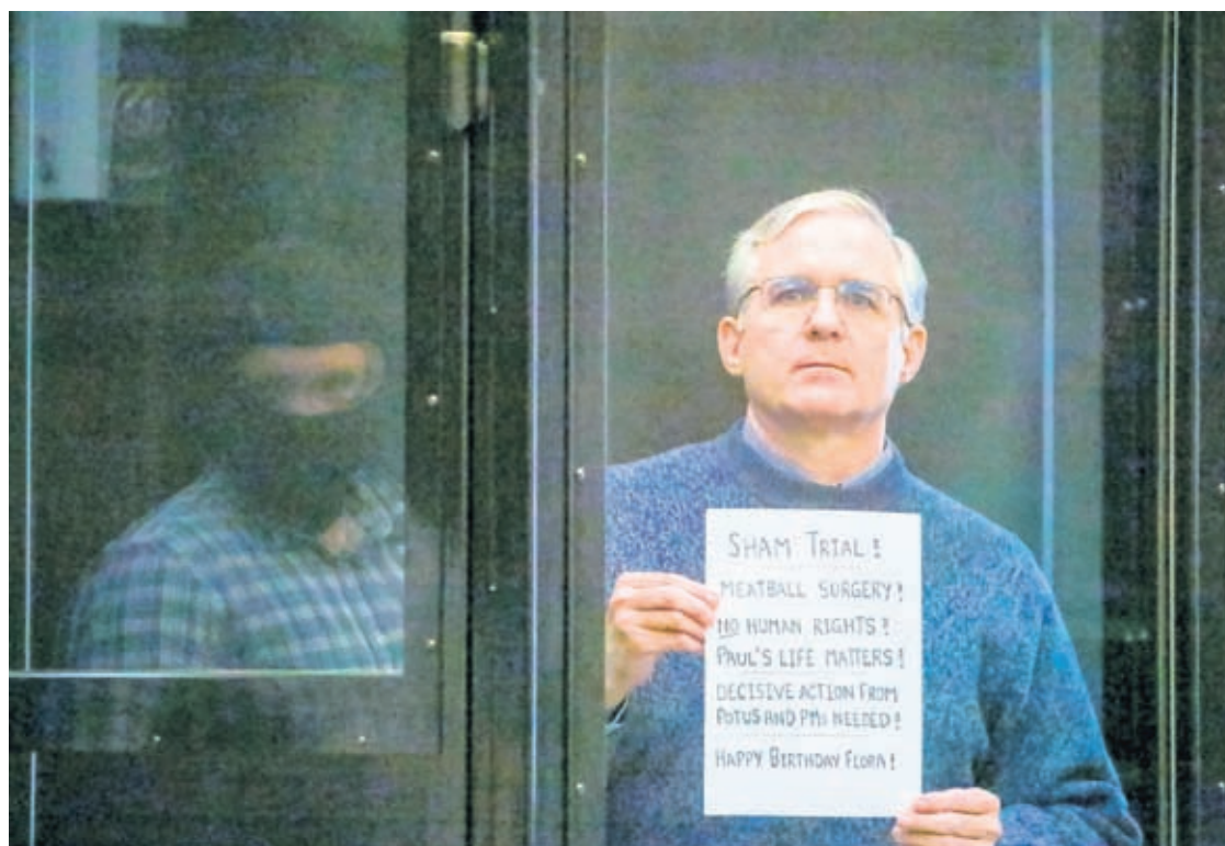
Paul Whelan, a former U.S. marine who was arrested for alleged spying, listens to the verdict in a courtroom at the Moscow City Court in Moscow, Russia, Monday, June 15, 2020.

He said his brother had been allowed one phone call in 18 months and had voiced concern about coronavirus infections in Moscow's Lefortovo prison,